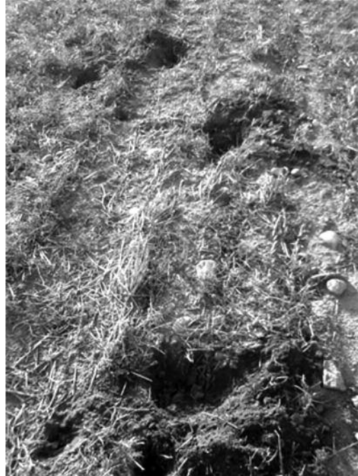
FIGURE 2. The adult female American Badger ( Taxidea taxus ) equipped with the radio-transmitter dug out a series of small, shallow holes while zigzagging along the fence line.

Sinuous hunting movements have been reported in the past for the Ermine ( Mustela erminea ) (Powell